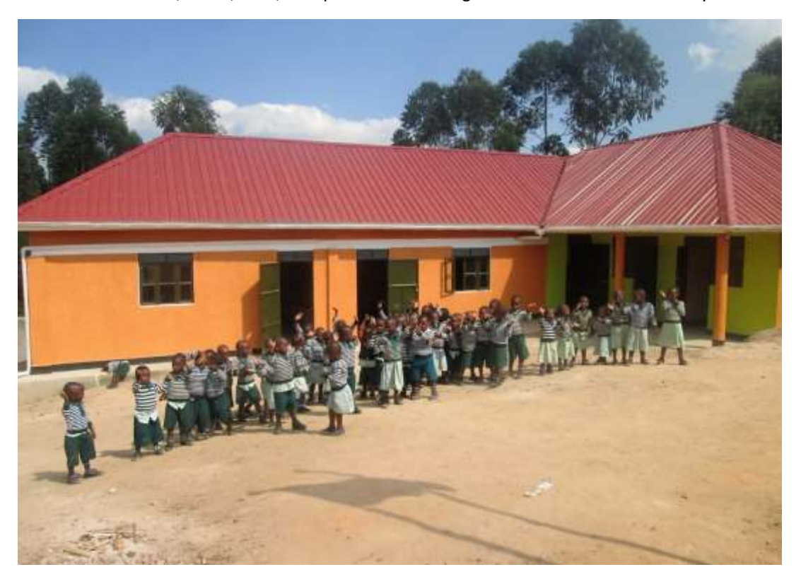
The nursery school compound is comprised of three buildings: a dormitory for 60 kids age 4-6, dining hall/kitchen, and classrooms/administration.

Also a perimeter wall, toilets, and on site water for drinking, washing, and cooking are now complete.