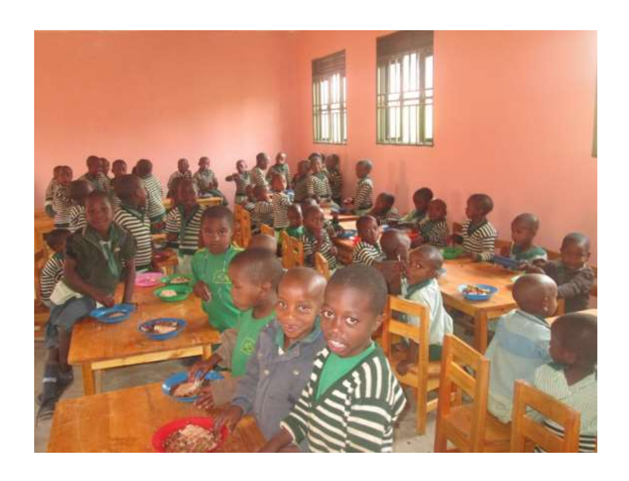
The children of Rubanda also wish to thank you. Their lives are better because of your kindness.