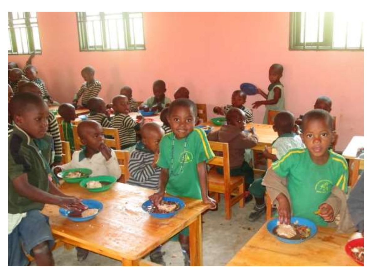
New desks, chairs, beds, mosquito nets are being constructed and installed daily.