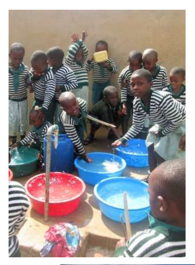
Thank you for continuing to make all of this possible and God Bless You All!