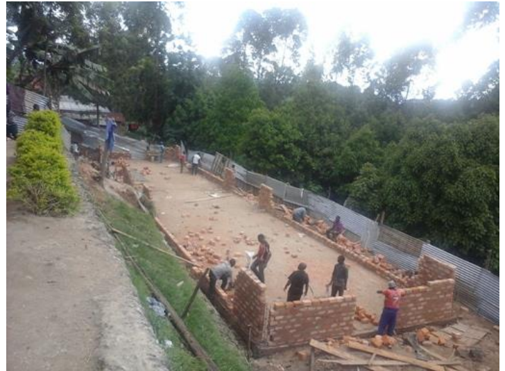
Construction of the new dormitory at the Primary School began in late November 2017