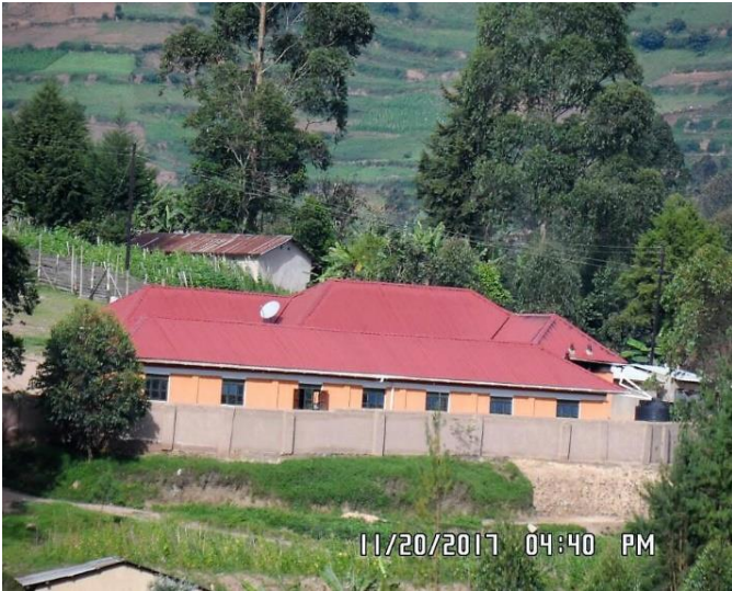
The Nursery School, completed in 2016